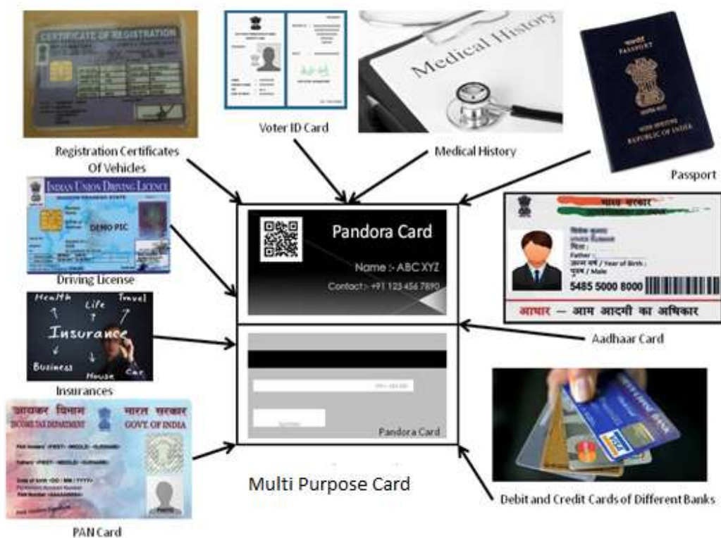
Figure 1: Multipurpose card containing all information

As India is moving towards complete digitalization, payments are done mostly by credit and debit cards. So why carry a different card for different account and remember PINs for each of the card differently. The Multipurpose card will be able to support payments through different accounts of a person just by swiping it at any of the PoS and can be used to withdraw money at ATMs. This will save time as well as space of carrying so many cards and documents at any place.